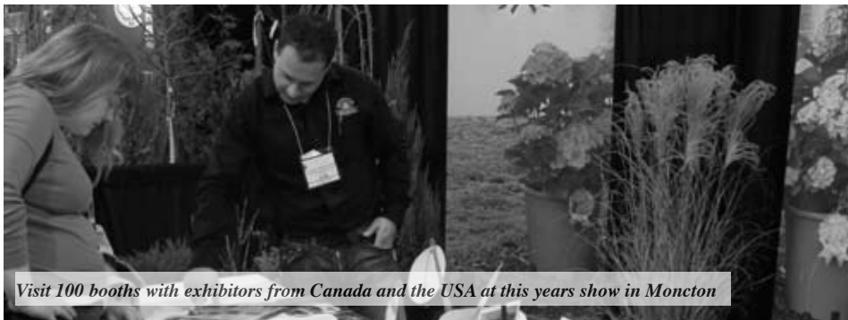
Visit 100 booths with exhibitors from Canada and the USA at this years show in Moncton