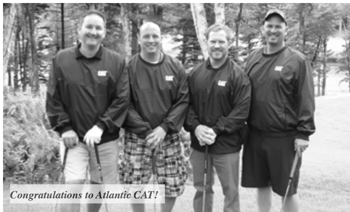
Congratulations to Atlantic CAT!