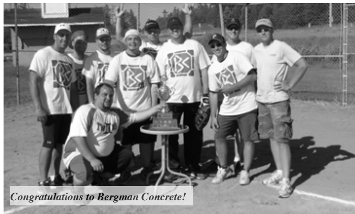
Congratulations to Bergman Concrete!

Thank you to our Golf Sponsors: Shaw Brick, Bergman Concrete, Atlantic Cat, Fralick Insurance, Wallace Equipment and Bobcat Atlantic! Thanks as well to Bell & Grant as the $10,000.00 Hole in One Sponsor. We also appreciated the companies that donated prizes for the event: MacIntosh Landscaping, Marsh Insurance, Bell & Grant and Coast Tire Auto Service. Thank you to our Softball Sponsors: Atlantic Cat, Shaw Brick and Wallace Equipment.