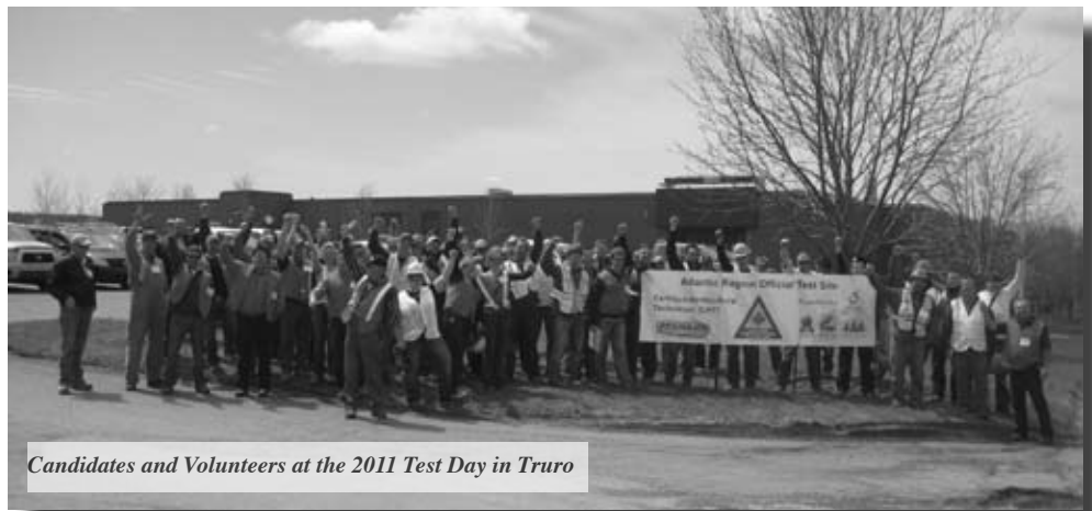
Candidates and Volunteers at the 2011 Test Day in Truro

As always, a great deal of gratitude goes out to the dedicated volunteers who come out every year to help make this test run as smooth as possible. The Atlantic Region Certification Committee would also like to thank Atlantic Cat, who sponsored lunch on test day, as well as the following companies who provided materials and equipment for test day: Atlantic CAT, Ayles Natural Landscaping, Blomidon Nurseries, Echo, Elmsdale Landscaping, Highland Landscapes for Lifestyle, Kubota Canada Ltd., NSAC, Stihl, Toro, Shindaiwa, and Shaw Brick. The Nova Scotia Agricultural College provides a great deal of support for this test and is the future site of the Atlantic Centre for Landscape Excellence, a place for training and testing for the industry.