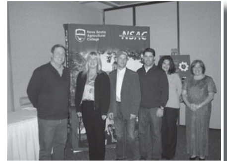
Winners of the 2008 Awards of Excellence in Landscaping