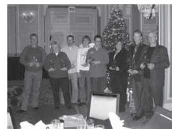
Winners of the 2008 Awards of Excellence in Landscaping