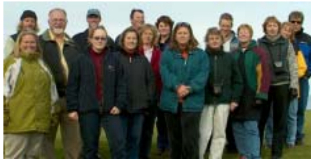
Under sunny skies and fall foliage, the Association of Atlantic Landscape Designers met at Fox Harbour Resort for their general meeting and annual field trip

QUESTION #4 The answer is: Sequoiadendron, Picea sitchensis Pseudotsuga